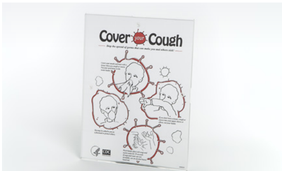
ICP-4-015 8.5 x 11 Sign Holder