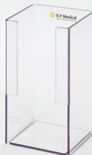
ICP-4-040 Scrub Brush Holder 10H x 5.5H x 5.125D