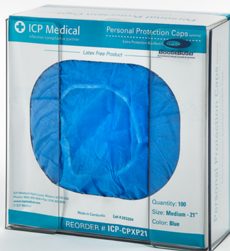
ICP-4-200BC(L) Bouffant Cap Holder 11H x 11W x 5D