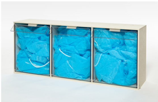
ICP-1443 3 Drawer Bin