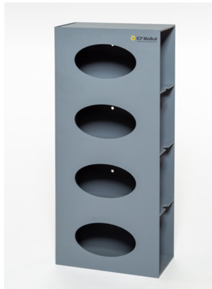
ICP-1445 Glove Box Holders (4) 21.75H x 10.25W x 4D