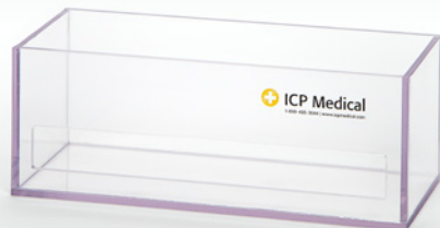
ICP-4-135 Trash Bag Holder 3.5H x 9.5W x 4D