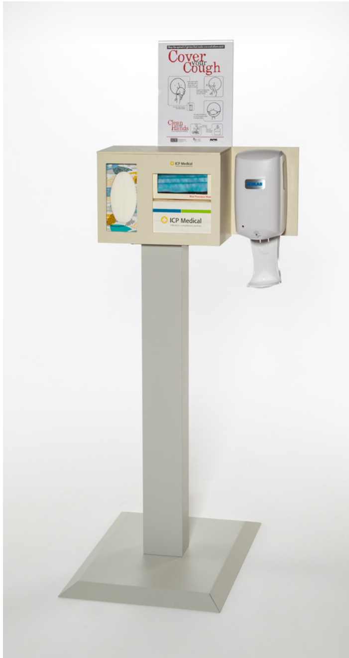
ICP-2100FL / ICP-2100PFL - Includes Base

Designed to meet your hospital's infection control need. The stations are great ways of reminding visitors at entrance and front desks to cover their cough. Made of beige ABS plastic.