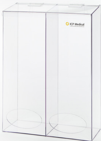
ICP-4-050 PPE Dispenser 17H x 12W x 6D