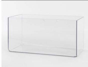
ICP-4-014 12Wx6Hx6D (P)