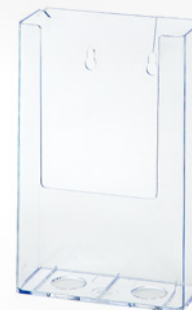
ICP-3-110 Brochure Holder