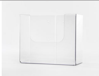
ICP-4-120 Fluid Shield 9½Wx7 5/8 Hx4¼ (N)