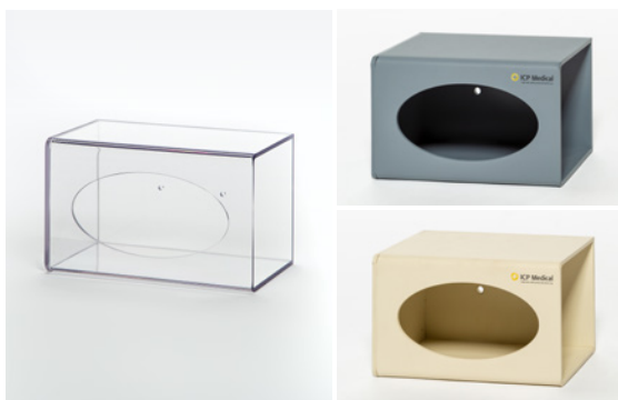
ICP-4-030 Mask Holder 4.875H x 8W x 4.375D