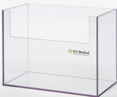
ICP-4-045 PPE Holder 8.75H x 11.75W x 6.75D