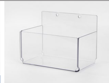
ICP-4-010 6Wx4¾Hx3.685D (I)