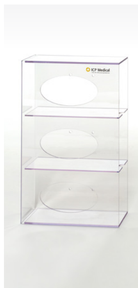
ICP-1444 Glove Box Holders (3) 16.75H x 10.25W x 4D