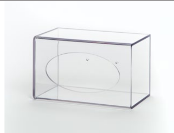
ICP-4-030 Fluid Shield 8Wx4.875Hx4¼D (R)