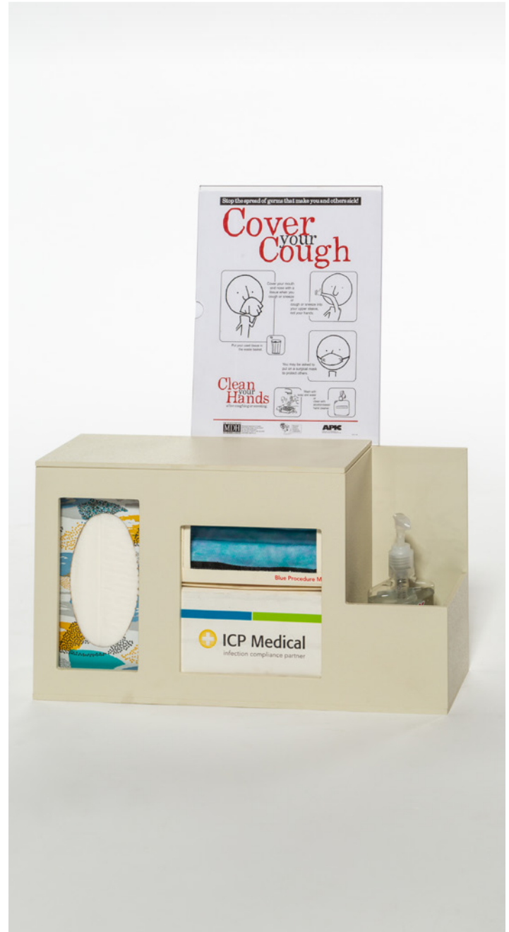
ICP-2100BX / ICP-2100PBX - Includes Base