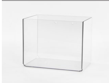
ICP-4-121 Mask Box 8Wx5½Hx5½D *M)