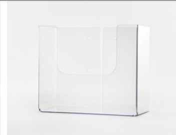
ICP-4-120c Fluid Shield 8Wx7½Hx4¼D (O)