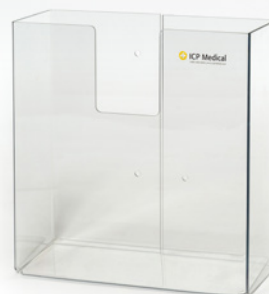
ICP-4-122(E) Gown Holder 12H x 12W x 5.5D