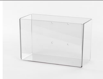
ICP-4-016 9Wx6Hx3½D (J)