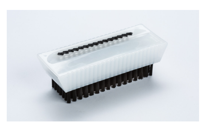
Surgeon's Scrub Brush

$38.16 box / $3.18 each (12 per box, 4 box minimum)